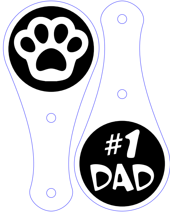
Engrave & Cut Design